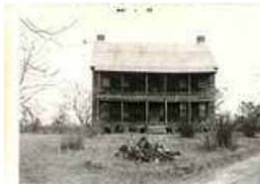
Entzminger house, Blythewood, Richland Co., SC