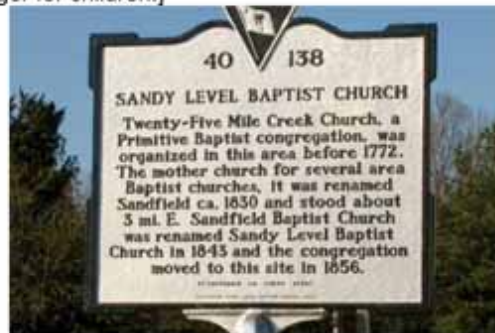
Cemetery where many Entzmingers are buried