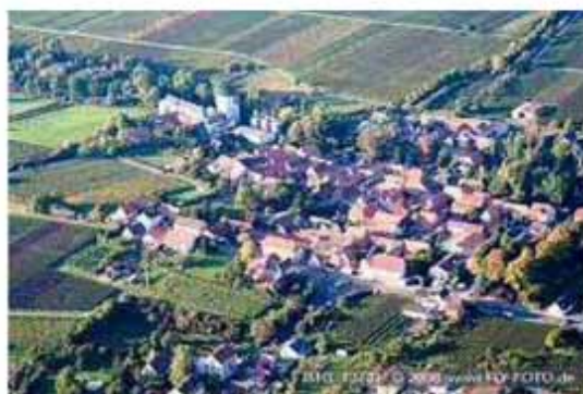
View of Appenhofen, Alsace