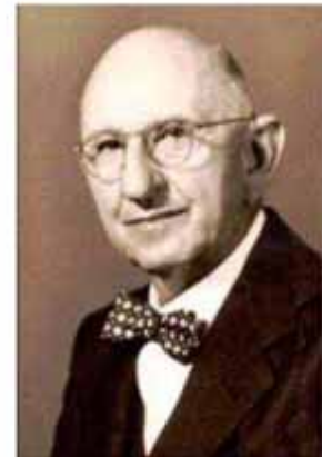
First Baptist Church Sunday School