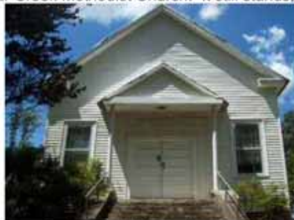
Cedar Creek Methodist Church