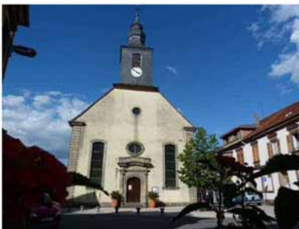
Diemeringen Protestant Church

As noted above, the earliest evidence of this Ensminger family was discovered in Diemeringen, Alsace. Ensminger ancestors lived in several villages mentioned in this book that were then within the provinces of Lorraine and Alsace. The administrative incorporation of the provinces of Alsace and Lorraine into France during the French Revolution was completed in 1789. The province of Alsace became the Department of Bas-Rhin, Alsace, France. The province of Lorraine included four Departments, including the Department of Moselle, France. The French legislature passed territorial reform in 2014 that resulted in the merger of the Alsace administrative region with Champagne-Ardenne and Lorraine to form Alsace-Champagne-Ardenne-Lorraine.