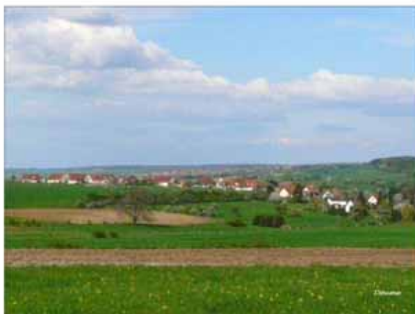
Diemeringen at the edge of town