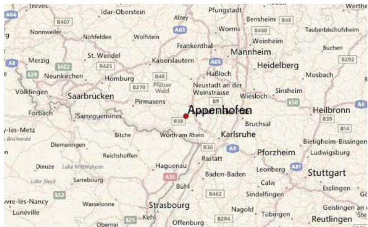
Partial German Map showing Appenhofen, Pfalz, Germany