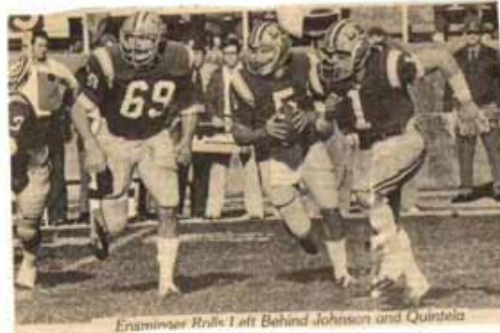
Quarterback at LSU