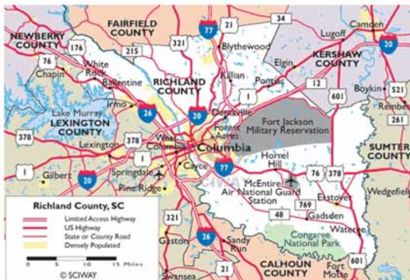
Map showing where early members of the Entzminger family lived